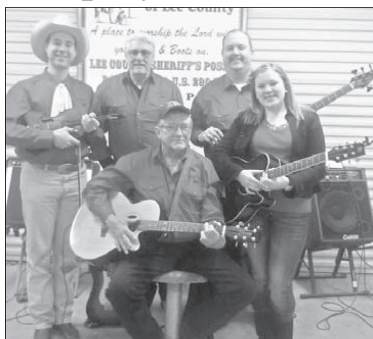
Lee County Cowboy Church band, Second Chance, will host the Country Gospel Jamboree Sunday, April 7, in Giddings High School auditorium. Admission is free.

Tired of what is passing for music today on the radio? If so, make plans to attend the first annual Country Gospel Jamboree, to be held Sunday, April 7, at the Giddings High School auditorium.